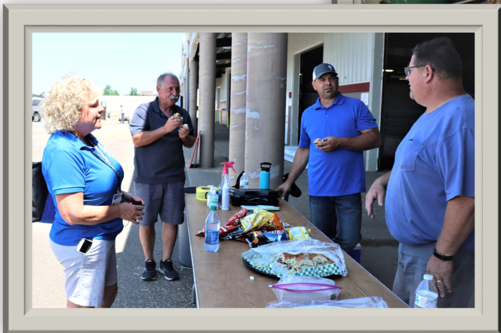
Taking a lunch break during vet checking on Monday.