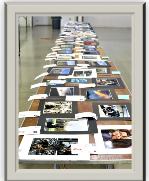
Want to see what Linn County's 4-H and FFA kids have been doing with cameras? Come on out to the Linn County Fair & Expo Center and take a peek at the many photos and other artworks on display this week.