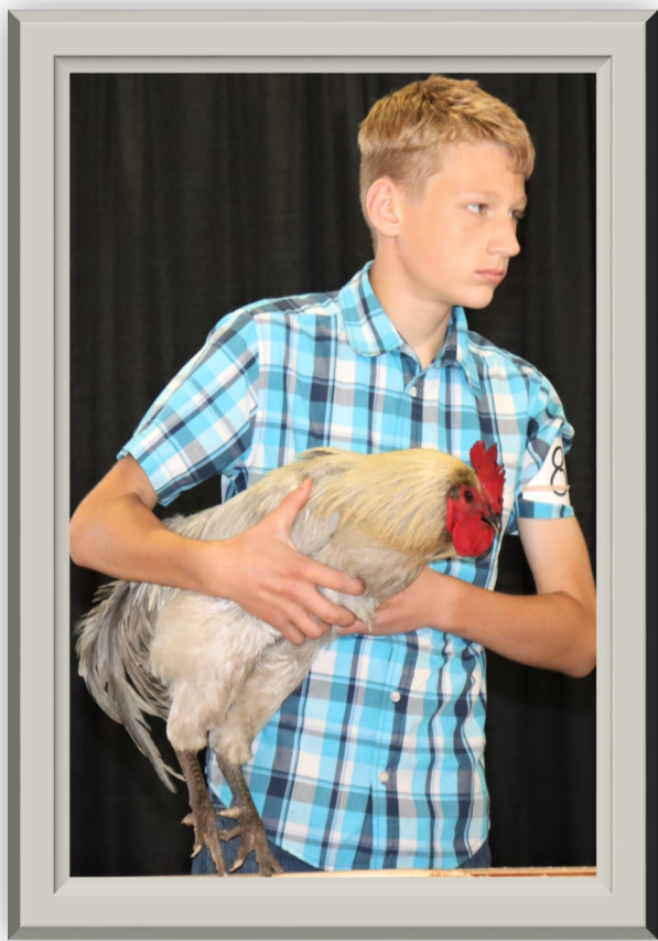
Waiting for judging.