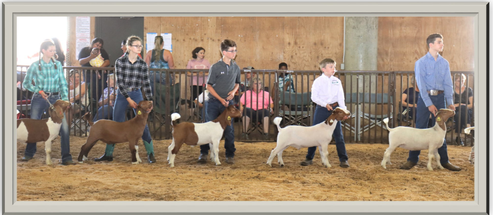
Goat showing time.