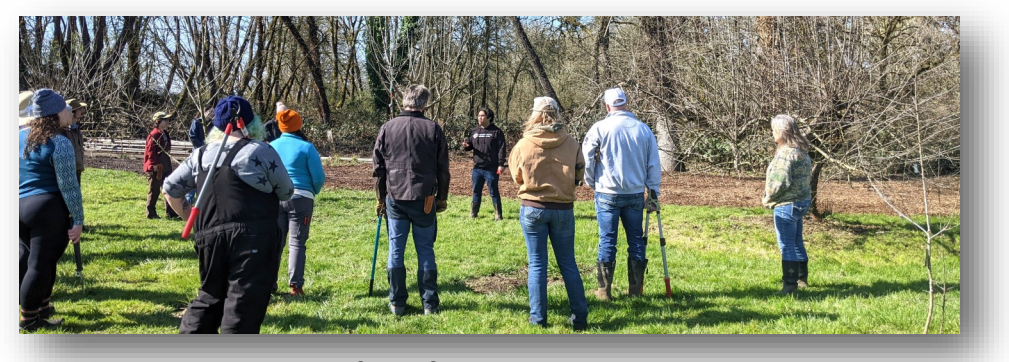
Regional on-farm fruit tree pruning workshop.

She connected him to both the regional small farms network, the Military Veterans Network, OSU Forestry spe-