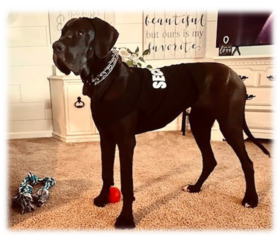
Bleu, Chrystal Parker's 11-month-old Great Dane. Chrystal is with Developmental Disabilities.