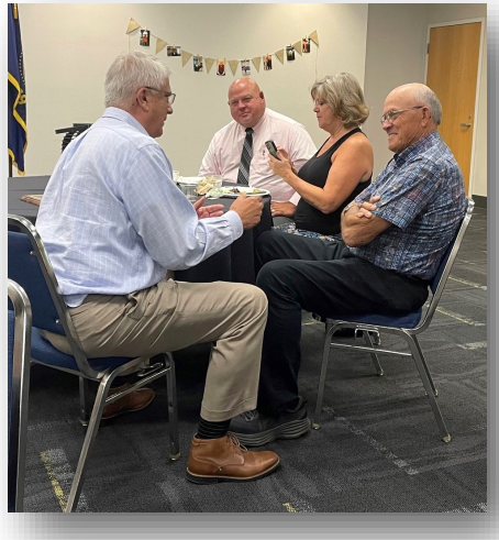
He then served in the U.S. Air Force, Mountain Home, Idaho.

He completed a rotating internship at St. John's Mercy Hospital in Creve Coeur, Mo., and a family practice residency from the Community Hospital of Sonoma County in Santa Rosa, California.