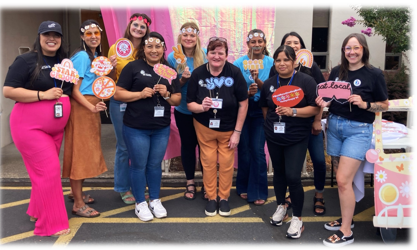
Linn County WIC staff and breastfeeding peer counselors