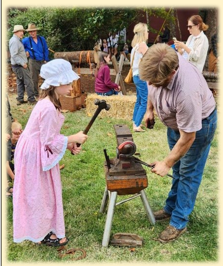
Fine-tuning blacksmithing skills.

Fun learning event was at Linn County Historical Museum Aug. 24